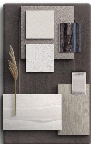
1 - WILD TRUFFLE