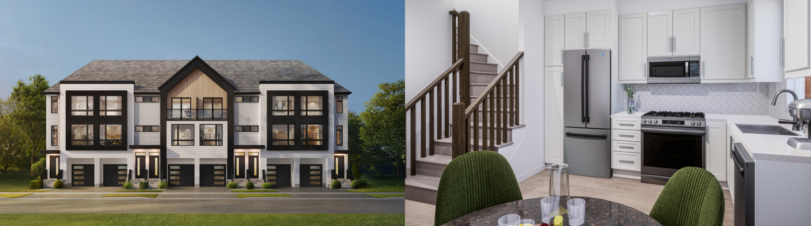
Esprit & Esprit Grande