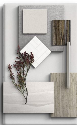
C - COSMOPOLITAN

Renderings are an artist's concept only. Final appearance of dwellings shown may differ due to site conditions, grading, municipal and/or architectural requirements, or the availability of materials. Designer packages shown are selections of colours and materials that may not be available at the time of selection. In addition, the final appearance of materials may differ due to lighting conditions, dye-lot, or other factors. E & OE August 1, 2023