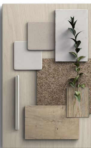
2 - VANILLA SKY