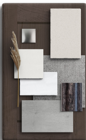
B - SLOANE SQUARE