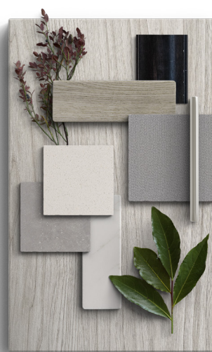
3 - SCANDINEUVE