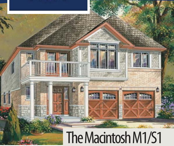
The Macintosh M1/S1