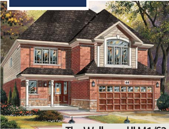
The Wellwood II M1/S2