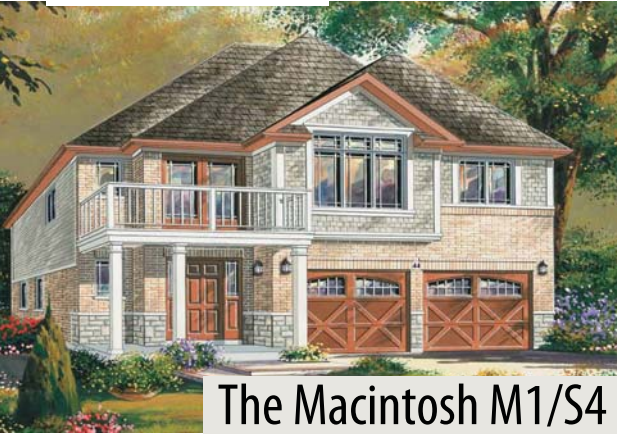
The Macintosh M1/S4