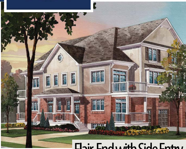
Flair End with Side Entry