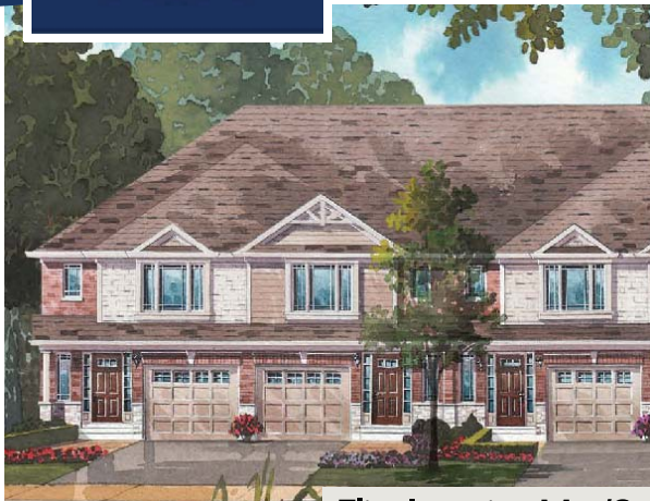
Elite Interior M1/S4